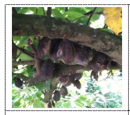
Figure 1. Cocoa shell attacked by pests

Cocoa shells infected with pests and diseases are isolated and observed in the laboratory. The results of the isolation of symptomatic cocoa are obtained as shown below: