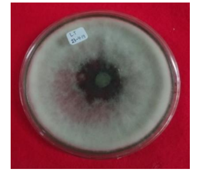
Figure 2. Lasiodiplodia theobromae fungi from isolation