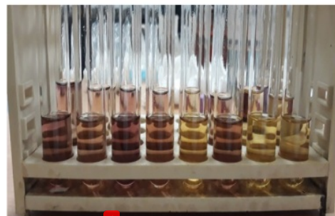
Figure 1: Testing the antioxidant activity of liquid smoke of cocoa pod skin DPPH method.

In this study also observed the value of Antioxidant Activity Index (AAI) which aims to determine the antioxidant activity index of liquid smoke of cocoa pods. From the research results obtained AAI values ranged from 0.186 to 0.466. This value is included in the weak category. This is consistent with the statement (Scherer and Godoy, 2009); (Faustino et al., 2010) which stated antioxidant