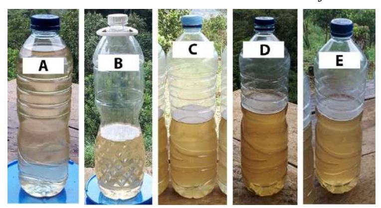
Figure 1. Distillation product of citronella oil

The traditional distillation device with capacity of 200 liters was emplyoed in this study. The distillation tank able to hold approximately 60–70 kg of raw material. The destillation system consists of a boiler, cooler (condenser), and separator. Other necassary glassware such as measuring cup, dropper, test tube and etc also prepared in this study. Citronella oil appearance as the result of differnt treatment can be visually observe in Figure 1. The GC-MS instrument that used in this study has the following specifications: Agilent Technologies 7,890 Gas Chromatograph with AutoSampler and 5,975 Mass Selective Detector and Chemstation data system. Column: HP INNOWAX. Capillary Colum Length (m) 30 \times 0.25 (mm) ID \times 0.25 (µm) Film Thickness. Carrier gas: Helium. Column mode: Constant Flow. Flow Column: 0.6 mL/minute. Injection volume: 1 µL.