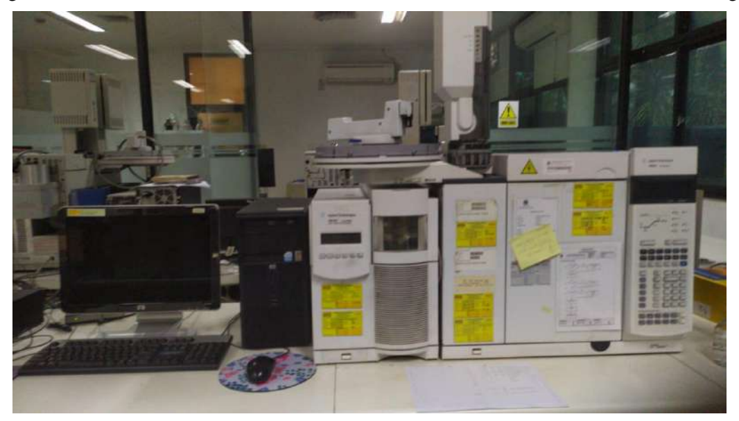
Figure 2. GC-MS equipment for the analysis of citronella oil chemical components

Right, before GC-MS equipment is employed, there is a calibration treatment with the following procedure: a row of the solution is made. After that, the solution is injected with the same volume into the injection site. The calibration line is drawn from the chromatogram, with the heavy substance on the horizontal axis, and the curve peak height or peak area of the curve on the vertical axis. Substance solutions are made as they appear in each monograph. From the chromatogram obtained with the same conditions as to how to obtain a calibration line, the area of the curve's peak area or the height of the curve's peak is measured. The amount of substance is calculated using a calibration line. In this way of working, all must be done in constant conditions. The instrument GC-MS can be observed in Figure 2.