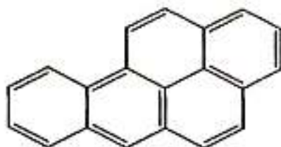
Figure 1 . 3,4 - Benzo ( a ) pyrene

Benzopiren is a compound belonging to the Polycyclic Aromatic Hidrokarbons ( Figure 2) . In a state of pure crystalline form (powder) is yellow with a melting point of 179°C and 312°C. The boiling point the molecular weight 252, is not soluble in water , slightly soluble in alcohol, soluble in benzene, toluene and xylem (Sax and Lewis , 1978 in Jaya et al. 1997) .