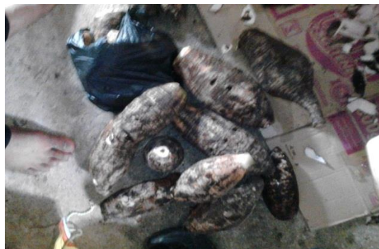
Figure 3. Umbrella taro type that will be used as taro flour

The initial stage in the manufacture of taro flour is to prepare the raw material taro tuber with good quality, avoided taro that begins to decay to get good quality flour. Umbu taro used a kind of gembili obtained from the region Sioban Mentawai. The raw material of taro flour production like picture 3 below.