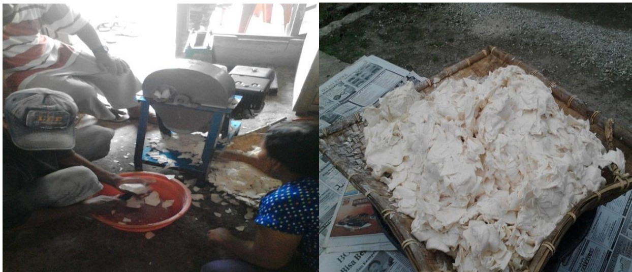
Figure 5. The process of slicing taro tubers and taro tuber soaking results

Furthermore, sieving is done to minimize tuber size using taro slicing machine becomes thinner and the size is uniform so that the surface area for evaporation becomes bigger so that accelerate drying. After that taro slices soaked in water bath with temperature 40°C for 3 hours. After soaking in warm water followed by soaking with 10% NaCl solution for 1 hour. Immersion with warm water and NaCl solution aims to reduce the oxalic acid levels that cause itching when eating taro [8]. After the immersion is soaked itchy mucus that enveloped taro then after immersion with NaCl washing with water flow first to remove the mucus. The process of slicing and soaking tuber taro tuber that has been sliced like picture 5 below.