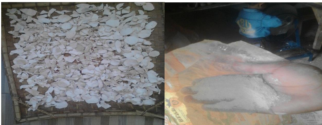
Figure 8. Sliced taro tuber after dry and taro tuber flour yield

Next to the taro slices after being dried and obtained from the grinding machine grinding as shown in Figure 8 below.