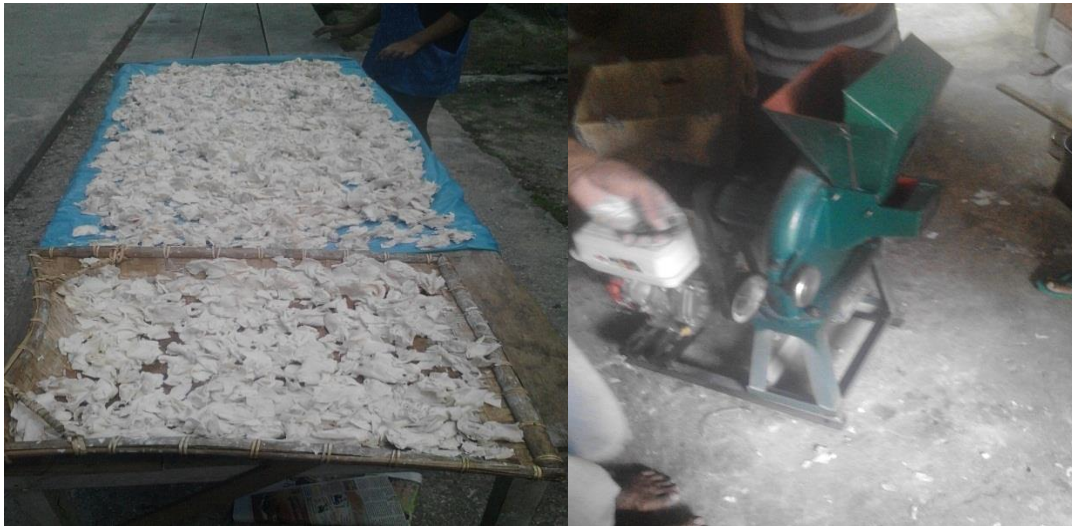
Figure 7. Taro tuber drying process using sunlight and disk mill grinding machine

Drying is the act of drying the material with solar energy in the open air with air humidity, air velocity and weather-affected temperatures. Drying by way of drying can be done by placing the material to be dried in places such as lamps / floor drying, mats, roofs, and on the highway. The advantages of drying that is not require special equipment and expensive and simple handling. While the disadvantages of drying this way are influenced by weather, longer drying time, uneven drying result and presence of dust contamination during drying.