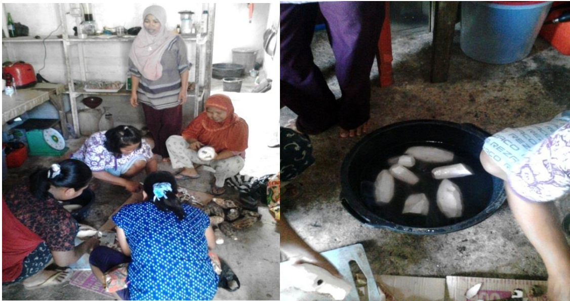
Figure 4. The process of stripping the taro tubers using a stainless steel blade

After the taro tuber is prepared, it is done to strip the tubers that aim to remove the skin. On stripping the skin properly done with clean and cultivated no soil attached to taro tuber meat like Figure 4 below.