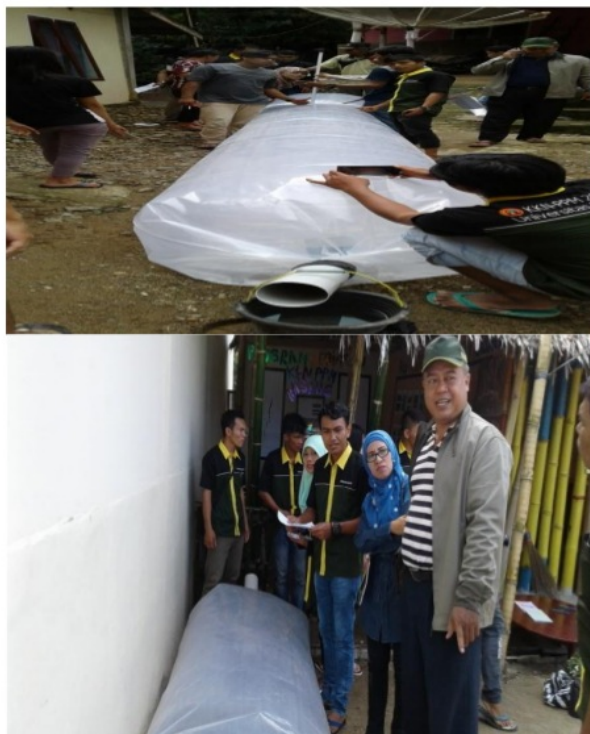
Figure 2. Installation of Biogas Digester system scale Households with balloons

Results from making biogas installations have been installed in the Cape Kanagarian Korong Kasang Districts of Batang Anai, Padang Pariaman district. Installation of biogas 1 unit biogas system with a balloon. The documentation of the installation of biogas as figure 2 below.