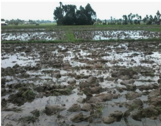
Figure 3. Waste biogas manure provided directly on paddy land farm location farmer groups tuah sakato 1

Some of the reasons why organic materials such as manure should be composted before use as fertilizer plants,