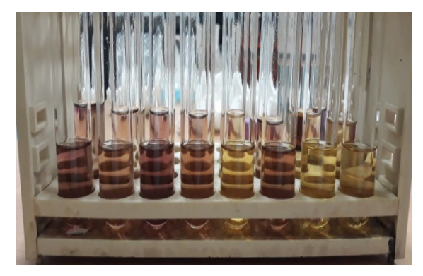
Figure 1: Testing the antioxidant activity of liquid smoke of cocoa pod skin DPPH method.

In this study also observed the value of Antioxidant Activity Index (AAI) which aims to determine the antioxidant activity index of liquid smoke of cocoa pods. From the research results obtained AAI values ranged from 0.186 to 0.466. This value is included in the weak category. This is consistent with the statement (Scherer and Godoy, 2009); (Faustino et al., 2010) which stated antioxidant