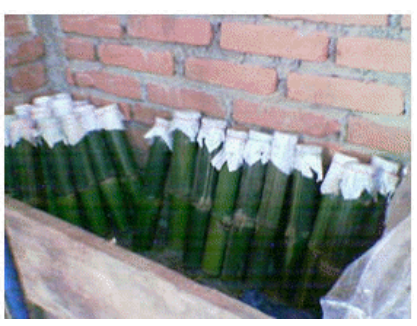
Traditional Incubation. The bamboo tube was propped against the wall in the corner of the room, without temperature control

Incubation using an incubator: Bamboo tube filled with milk is put into the incubator (Figure 1) and the temperature is 39 \,^{\circ} C and RH 60% humidity. The incubator is made with an aluminum rod frame measuring 150x60x50 \, cm. The walls are made of 4 mm thick glass and the back walls of 2 mm aluminum plate. The heater uses a 220 V 100W electric heating element, equipped with a thermohygro regulator to regulate the temperature and humidity in the incubator. The shelf with a height of 40 cm to place a bamboo tube filled with milk to be incubated.