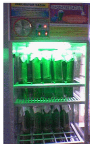
Incubation with Incubator. Specification: Frame: Aluminum Wall: 2mm glass Dimension : 40x40x150cm ower: AC 220 60W Control system: Thermohygro regulator Temperature: 39 °C Humidity: 60% RHP