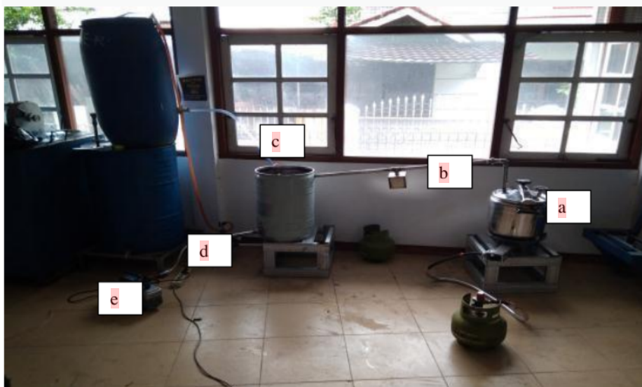
Figure 1. Construction of liquid smoke making equipment a). Pyrolysis tube b). Smoke channel pipe, c). Condenser, d). Liquid smoke container. e). Vacuum pump

The design of the liquid smoke maker can be seen in Figure 1. The design of the tool is based on the existing liquid smoke maker and the study of literature. The results of designing and manufacturing obtained a pyrolyzer with a volume capacity of 27 liters equipped with coolant, a container of liquid smoke and heat sources derived from gas stoves and vomp vacuum